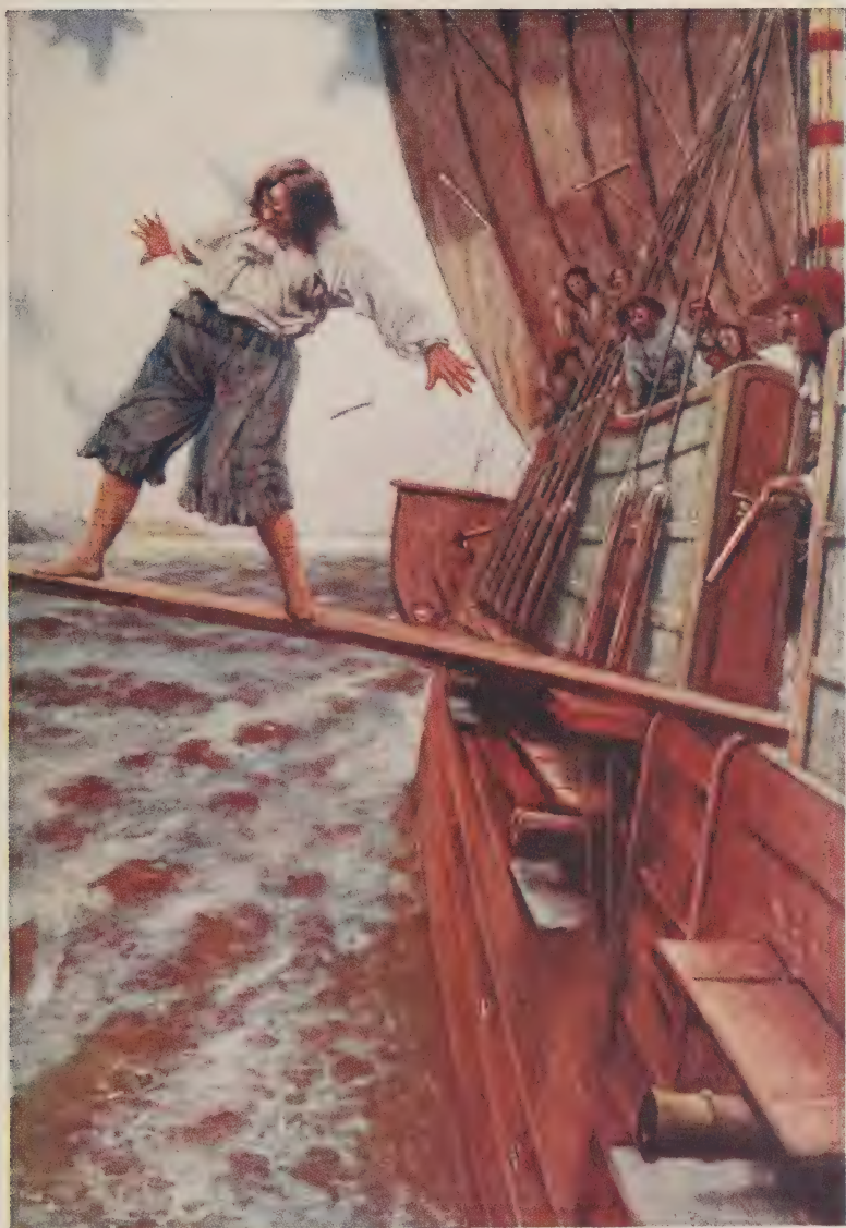
STEPPED OUT UPON THE PLANK